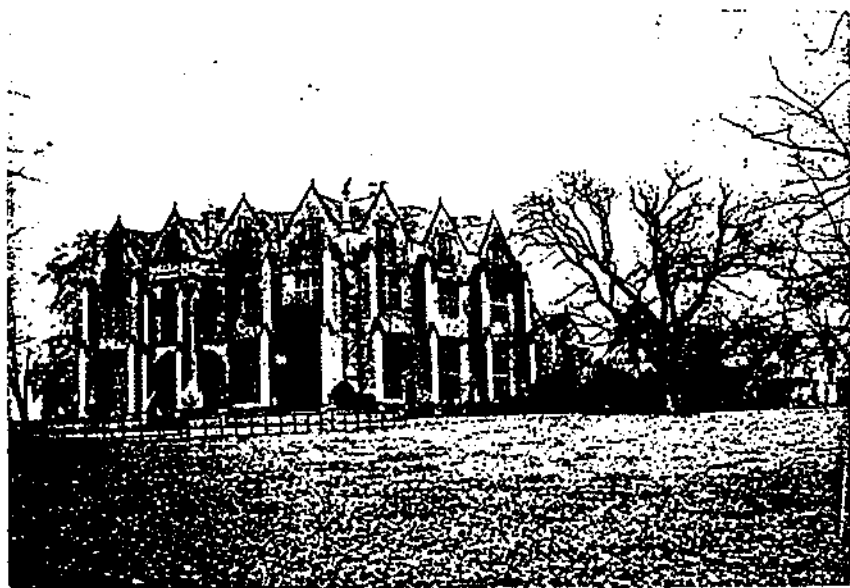
TIMSBURY MANOR HOUSE. Residence of the Somersetshire Sanborns for three centuries.