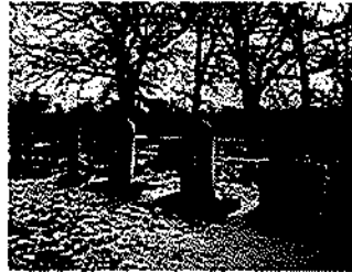
The Sanborn-Orvis Cemetery.

Samuel and Lavinia Orvis lived in the old Sanborn house on Wilmot Rd, English Prairie, built before 1840. The house had 17 rooms, 5 fireplaces, and 3 cellars. The barn was attached to the house. The lumber came from trees on the farm.