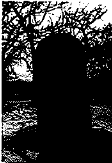
Mehitabel (Sanborn) Sanborn