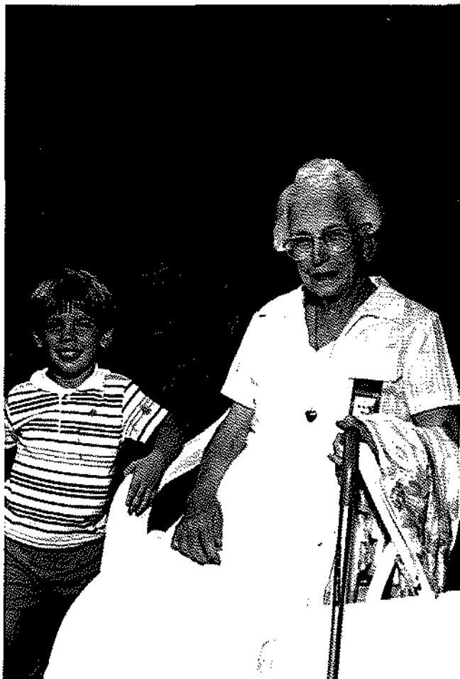
Youngest & Eldest at the 1990 Reunion